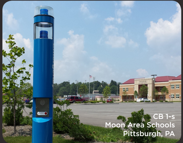
CB 1-s Moon Area Schools Pittsburgh, PA

Safety should not be the primary educational concern, whether you're a student, teacher or parent. Code Blue's comprehensive systems ensure that when class starts the focus can be on the lesson plan because a strong emergency plan is already in place.