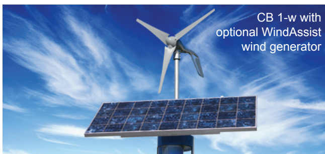
CB 1-w with optional WindAssist wind generator