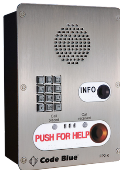
CB 6-f shown with LS1000 Dual Button Speakerphone with Keypad.