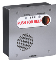
Single Button Flush Mount IP2501-s