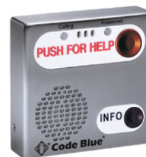
Dual Button Surface Mount IP2500-d