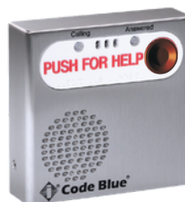
Single Button Surface Mount IP2500-s