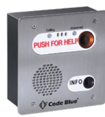
Dual Button Flush Mount IP2501-d