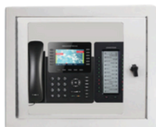
Mounted Central Station

IA4100 analog speakerphones can be connected to a patch panel and powered by a distributed power supply. An IAD will provide dial tone and connect to the Fusion Server and central station.