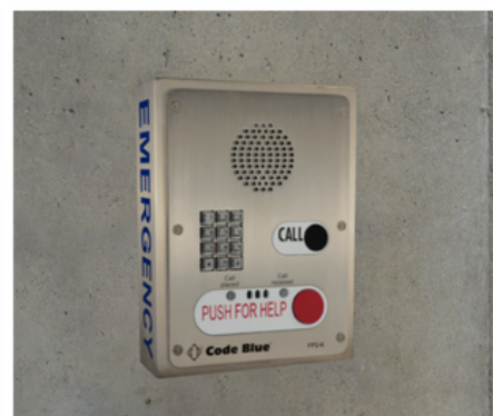
LS1000 shown in CB2-a, CB4-u, CB9-s, & CB6-s enclosures