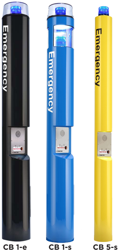
CB 1-e CB 1-s CB 5-s