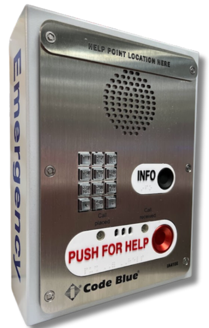
IA4100-K shown, with top location being used.

Note: Specifications subject to change without notice or obligation on the part of Code Blue Corporation.