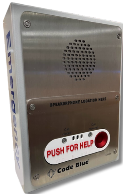
LS1000-S shown, with center location being used.