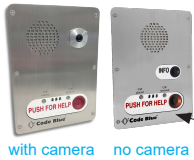
with camera no camera