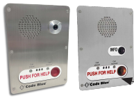
with camera no camera